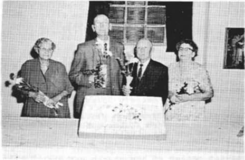
1967 80th ANNIVERSARY