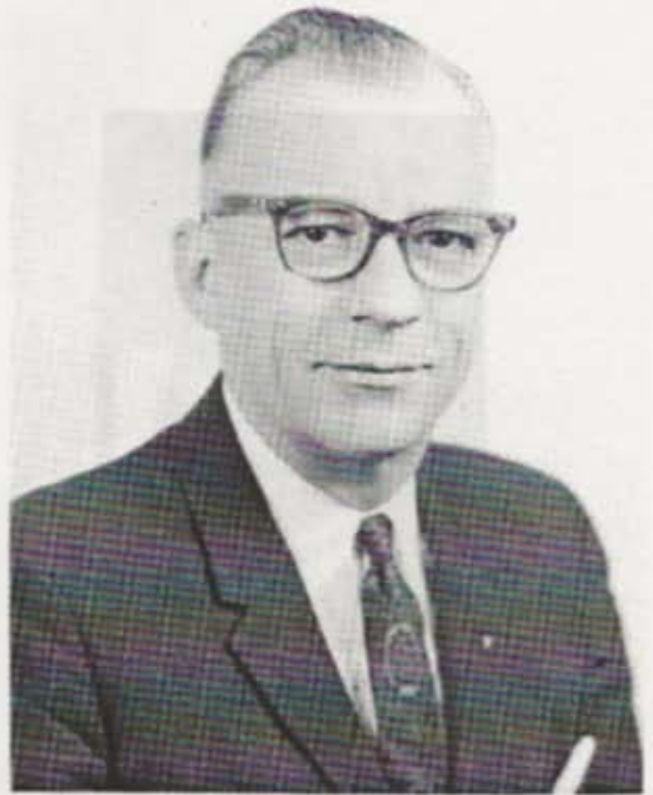
ERNST PRESS 9/1942-8/1947