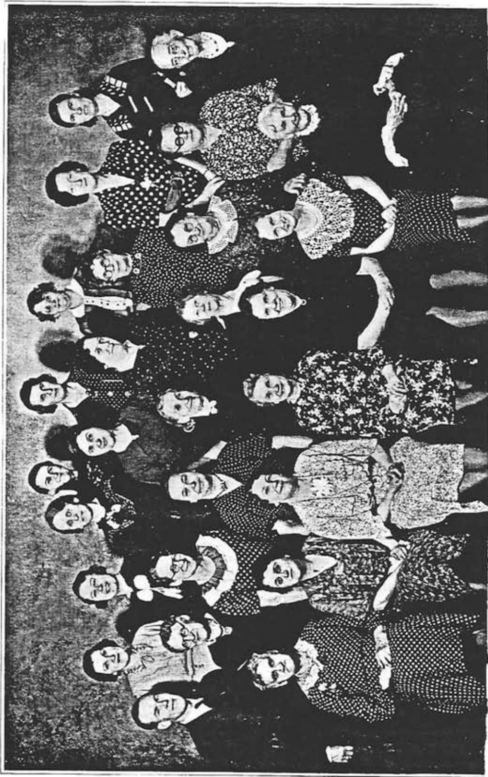
1937 (50th anniversary) WOMEN'S FELLOWSHIP