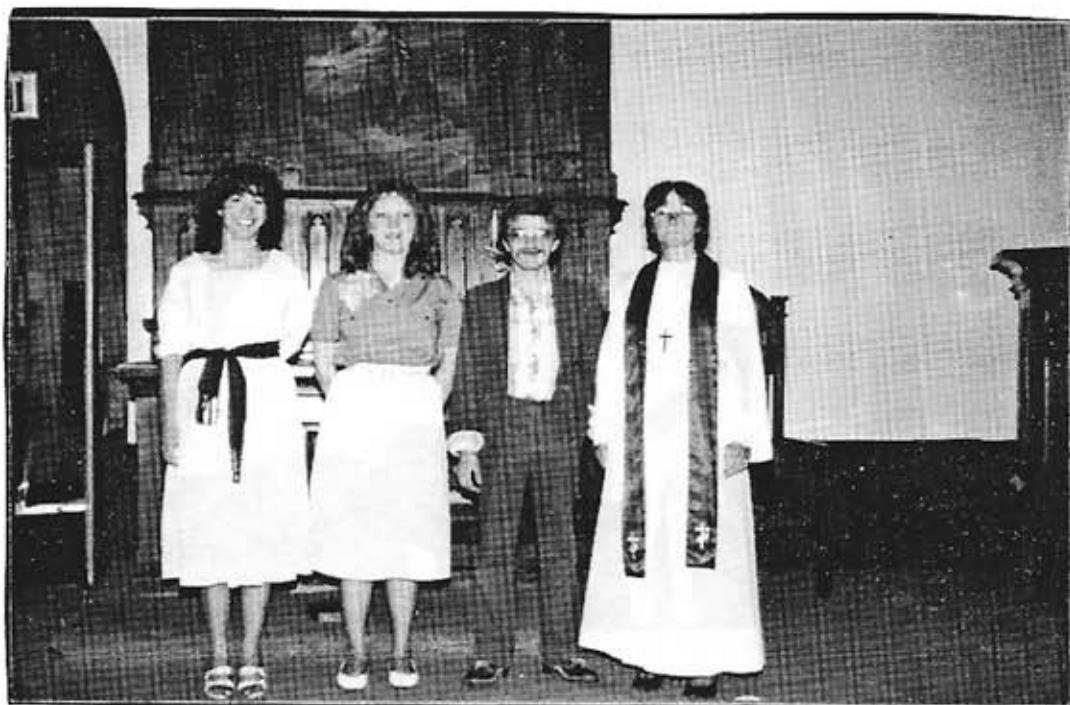
1986 CONFIRMATION CLASS