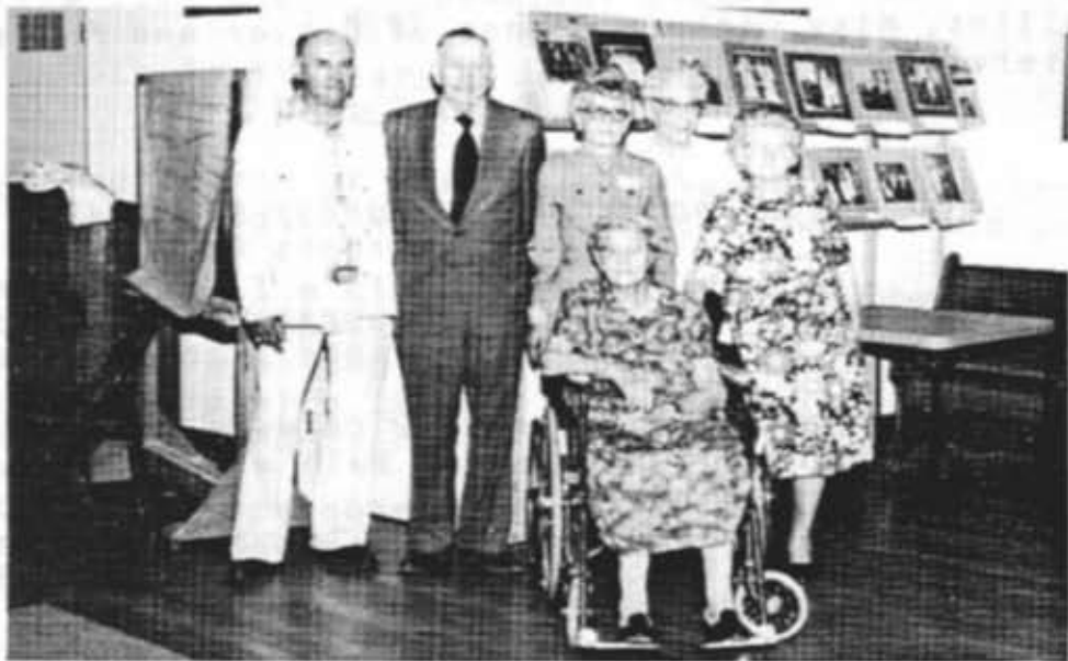
1977 90th ANNIVERSARY